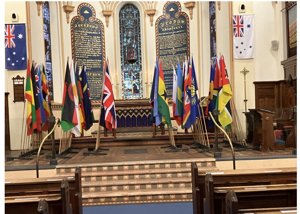
Commonwealth flags displayed in Christ Church, North Adelaide, for Commonwealth Day service