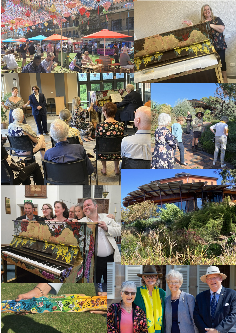
RCS members at many RCS gatherings